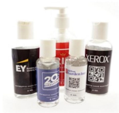
Hand Sanitizer Bottles

Want to see other alternatives to wearing a mask, click here